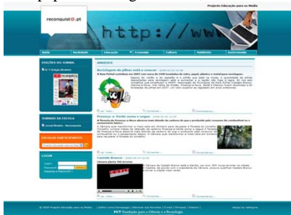
Template for on-line newspapers production

Although authors as Breda (2005) and Gonçalves (2007) considering that it is too soon to what they call “ciber derive” of the school newspapers as they estimate that the number of schools that edit a school newspaper does not reach more than 10 per cent, we decided to create tools so that students and teachers could produce on-line school newspapers on a regular basis, even without expertise in the field.