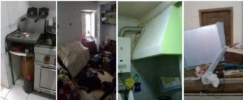
Fig. 5. Examples of fire safety problems found within the old town buildings

In the present study area, several aspects were found, both internally and externally, that contribute to the outbreak of a fire and to its propagation. At the internal level there are very old and damaged electrical installations, degraded gas installations, gas cylinders in unventilated places and near the stoves, kitchen cloths hung on the stoves and next to the water heater, the water heater hoses outside the walls, as well as heater tubes passing inside cabinets. Moreover, great amount of garbage all over the buildings, specially in the lofts, and also some beams of the roof in a rotten state (Fig. 5).