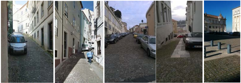
Fig. 6. Examples of fire safety problems concerning accessibility