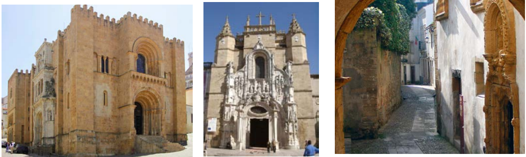
Fig. 2. Historical buildings and routes of the old town of Coimbra

The "University of Coimbra - Alta and Sofia" has been inscribed on the UNESCO World Heritage List since June 2013, following the unanimous decision of the World Heritage Committee. This property includes 31 buildings of great relevance, in an area of 815000 m 2 .