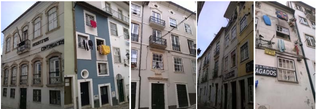
Fig. 3. Examples of old town building façades of Coimbra

The urban area of this study presents a particular morphology, where the streets and blocks, are the traditional character, with diverse dimensions and geometry, and a wide variety of trade and provision of services, in particular at the level of the ground floor. Being this a strong tourist attraction zone, there are some trade points strongly oriented to tourism. The streets are mostly narrow and curves ( Fig. 4 ), allowing pedestrian access and, in some streets, access to transit, noting that the passage of a fire combat truck is very hard or demanding very complex maneuvers. In the situation to find vehicles parked on the street, the vehicle of the fire fighters cannot effect the passage.