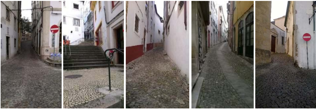
Fig. 4. Views of the narrow streets of the old town

It should be noted that in the area of the faculties there are some milestones, which make it even more complicated the access and movement of fire fighter vehicles. There is also the zone called "back-breaker", which is an area mostly consisting of stairs allowing pedestrian access only, getting the limited traffic off at the beginning of this zone. The access for this and some other places is only possible by climbing very steep stairs.