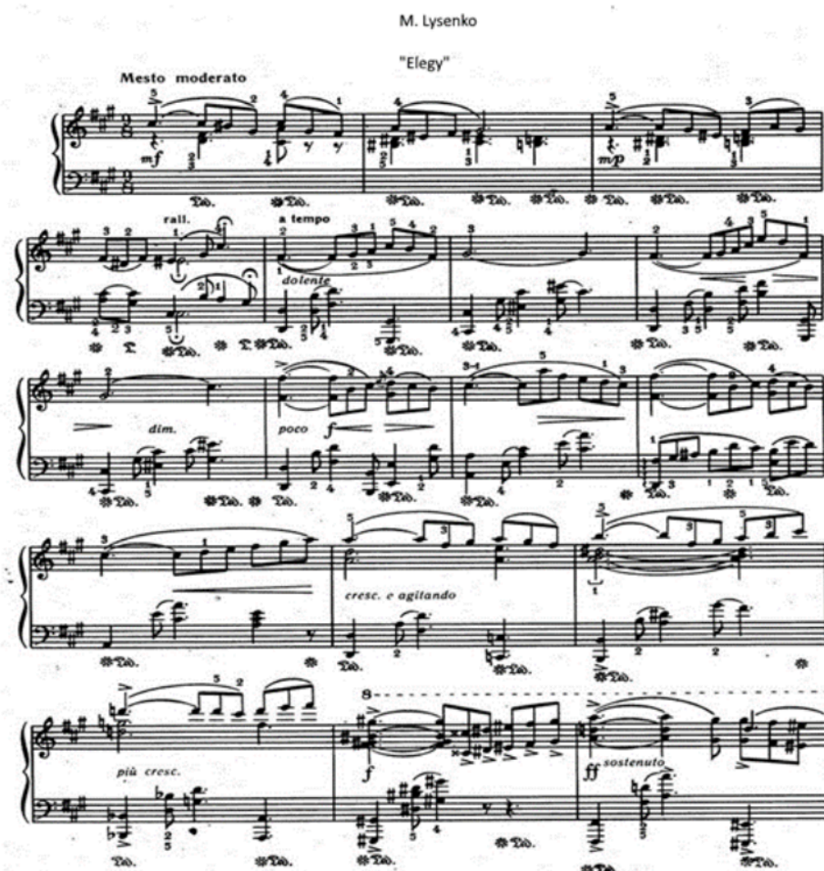
Fig2. M. Lysenko: "Elegy" for piano. Source: [7].

gentle and fragile lyricism) and the concert performance style in the traditions of F. Mendelssohn Bartholdy, F. Chopin, F. Liszt, R. Schumann, J. Brahms (solo and ensemble), use of national folklore ("First Rhapsody on Ukrainian Themes" (1908)) in brilliant improvisations, arrangements and transcriptions. One of the leading meanings for the achievement of a high level of interpretation of Lysenko's compositions is free possession of the system of technical methods discovered by Chopin and Liszt which implies the relief display of a melody as a fundamental element of the composition, virtuoso performance of passages in octaves, expansion of timbre possibilities of the piano, employing the use of volumetric resources of its outer registers.