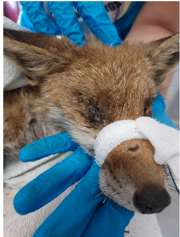
Fig. 1. Admission at the Wildlife Study and Rehabilitation Centre (CERAS) of a juvenile male red fox ( Vulpes vulpes ).

The therapeutic approach included topic application of 1% fusicidic acid (Fucithalmic®; Amdipharm, Dublin, Ireland) BID for 7 days and diclofenac (Voltaren®; Novartis, Baden, Germany) BID for 3 days, external deworming with fipronil and permethrin (Frontline Tri-act®; Boehringer Ingelheim Animal Health, Ingelheim, Germany) plus the combination of imidacloprid 10% and moxidectin 2.5% (Advocate®; Elanco Animal Health, Leverkusen, Germany) pour on, and systemic treatment with enrofloxacin (Baytril®; Elanco Animal Health, Germany; and Enroxal®; HCS bvba, Edegem, Belgium) 5 mg/kg, SID, firstly subcutaneous (SC) and then per os (PO) for 7 days, meloxicam (Melovem®; Dopharma, Raamsdonksveer, The Netherlands) 0.2 mg/kg, SID, firstly SC and then PO for 3 days, and intravenous fluids specifically lactated Ringers solution, 10% dextrose solution and a multivitamins and minerals solution (Duphalyte®; Parsippany, NJ, USA).