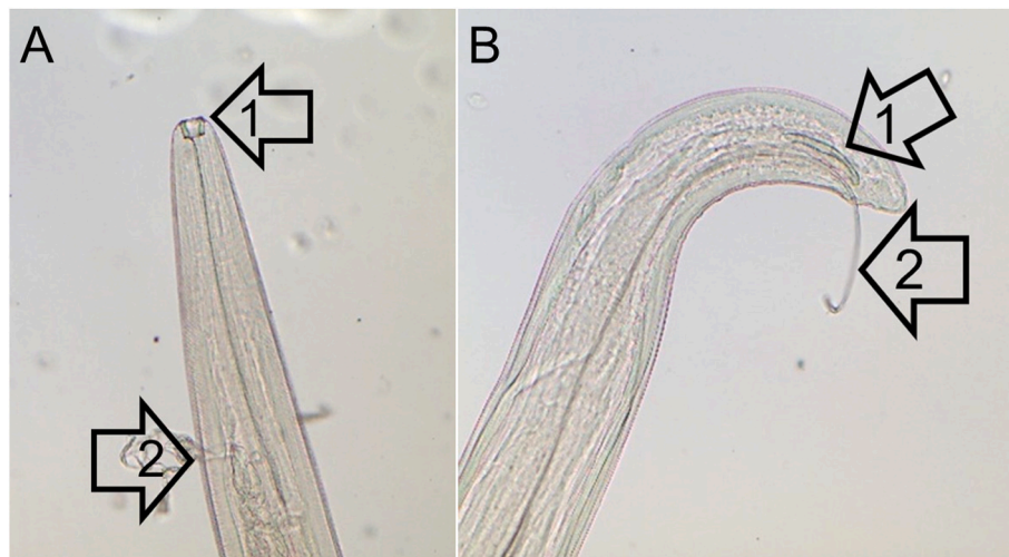
Fig. 3. A Adult female of Thelazia callipaeda : anterior extremity with buccal capsule (arrow 1) and vulva (arrow 2). B Adult male of T. callipaeda : posterior extremity with short spicule (arrow 1) and long spicule (arrow 2).