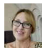
VIOLA DEMYDOVA 3

Project administration, Supervision, ORCID: 0000-0003-3359-459x