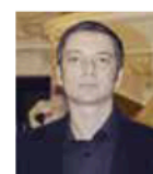
YURI KUCHURIVSKIY 4

Methodology, Resources ORCID: 0000-0002-8757-0385