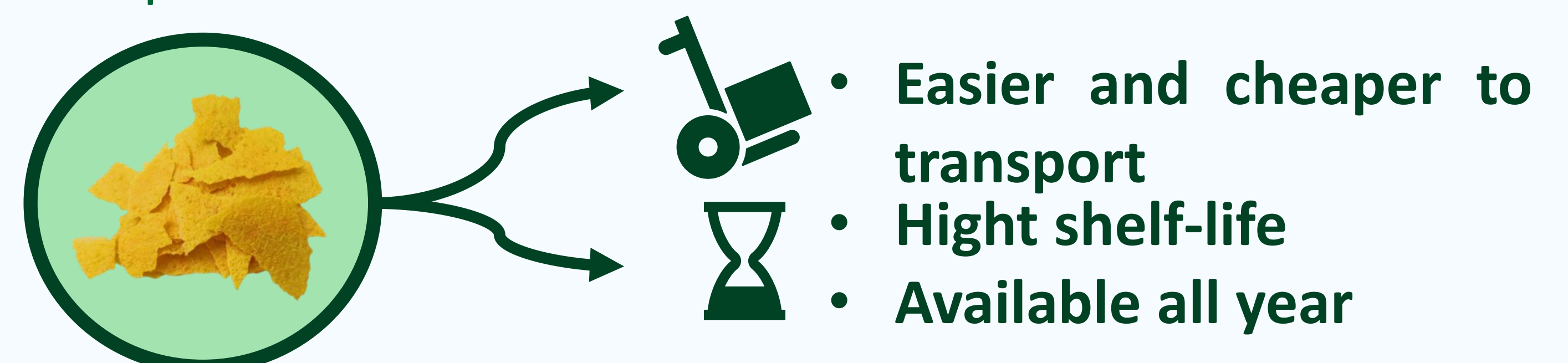
Fig 4 – Benefits of the product ( a_w 0.238)

The low content of a_w (free water available) limits enzymatic and chemical degradation reactions, as well as microbial development.