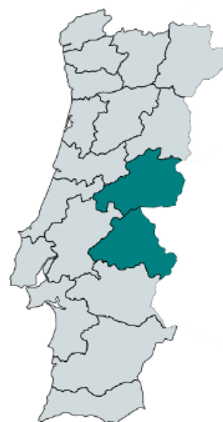
Fig.1. Castelo Branco and Portalegre districts.

Overall, positive dynamics have been observed in vulture populations in Western Europe 3 but continued, and additional monitoring is crucial. Sudden changes in trends following the emergence of new threats, such as outbreaks of infectious diseases, should be addressed.