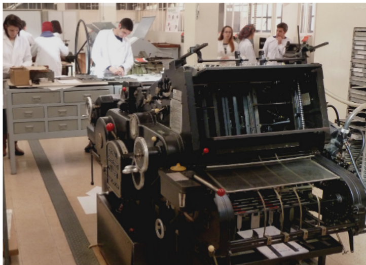
Fig.2 Example of the workshop space, equipment and materials available at Polytechnic letterpress lab

These spaces dedicated to practical exploration have a particular profile when implanted in an academic context. Their users do not have a specific or definitive role and they must be prepared to adapt to the unforeseen during the printing process, but they should also be willing to cooperate and share their experience. “The workshop is an active space, with bridges to other contexts, industrial and traditional, collaborative in essence, with congenital predisposition to the spread, in which we participate. This is the nature of the impression and the workshop, to make an idea multiply and spread through contact.” [11].