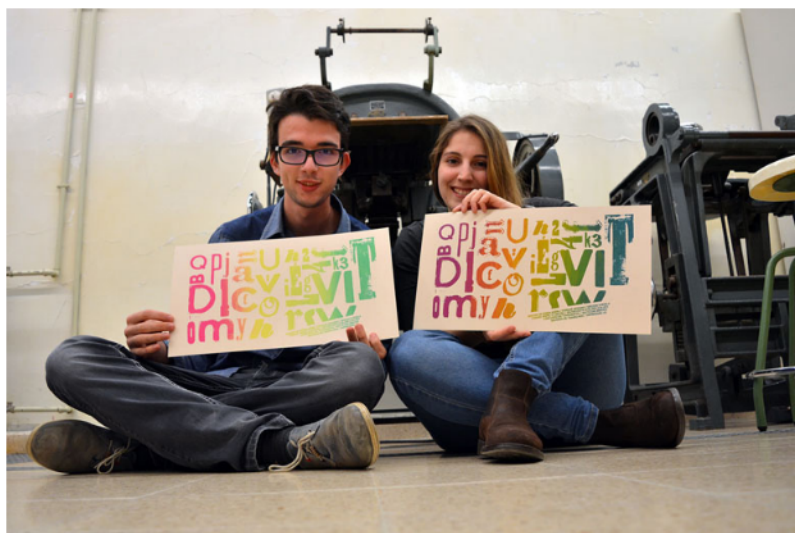
Fig. 7 Some of the students who were part of the i.E. Magazine #6 production team

In the specific case presented – i.E. Magazine # 6 – it was essential to use the laboratories where traditional letterpress or silkscreen printing could be experienced, making the student aware of a much broader reality beyond what they find on the computer, digital tools, or even within a traditional classroom. Having access to more experimental learning methods allows us to amplify the student's creative vision and is able to improve learning processes. The collaborative methodologies used in the context of a workshop are relevant in graphic design and editorial practices, placing the designer also as author, collaborator and producer, able to dictate content and practical solutions of high value. The improvement of the creative processes and the tools used, makes the designer as author, a more informed and conscious professional, allowing the approach to the technologies and contributing to their recognition and applicability in a professional context.