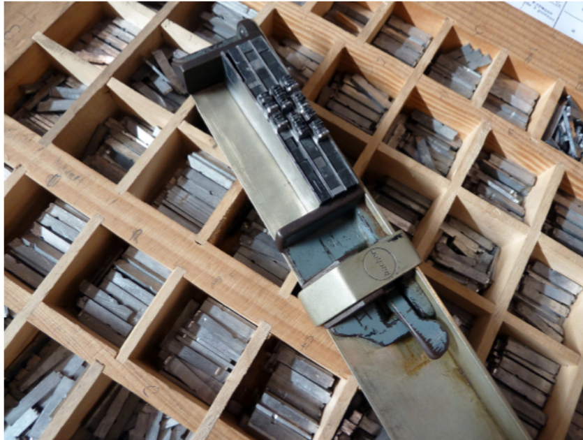
Fig.3 Example of the workshop space, equipment and materials available at Polytechnic letterpress lab

This is how designers can most easily become authors and producers, not merely projecting themselves as someone who solves a communication problem, but often as the author of that problem and the producer of a solution. Lupton [1] describes this new professional as a “maker of content and shaper of experiences”, a designer willing to get his hands dirty, face production problems that may occur while undertaking a project, prepared above all to find solutions and provide the final product. The collaborative and experimental character of these spaces in an educational context allows the student to explore their ability to design solutions that meet existing workshop conditions, preparing them for the possibility that the end result might not be the one originally intended. It is thus possible to explore the materiality of the end product as well, sometimes by taking advantage of chance or trial and error approaches, as well as combining the production resources in order to create new solutions to traditional problems.