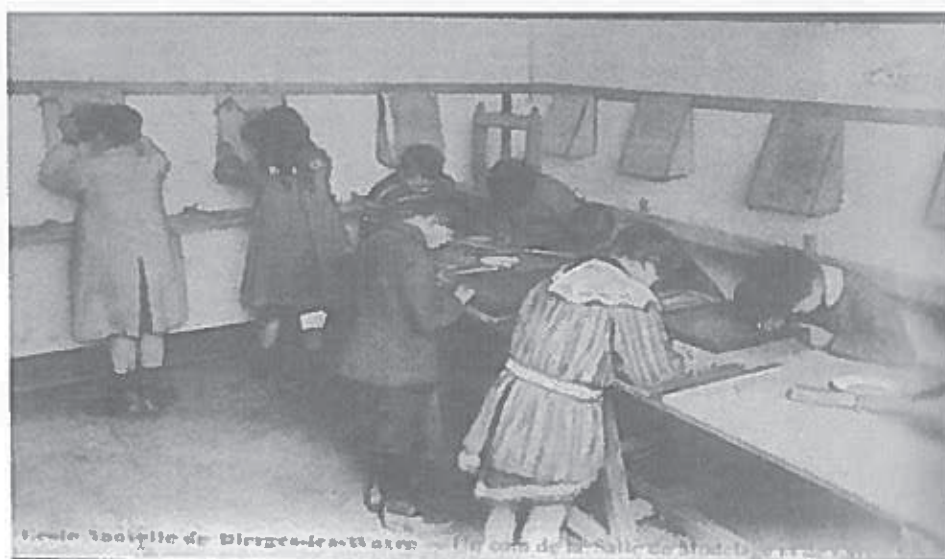
Figure 2. Working in the modeling room – School of Bièrges, 1913.