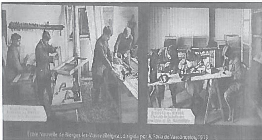
Figure 4. Working in the carpentry and in laboratory – School of Bièrges, 1913.

ing useful knowledge from natural and participant observations and induction (theory followed practice) by placing them in contact with the“ [...] forms of life and human labor” (Vasconcelos, 1915, p.102).