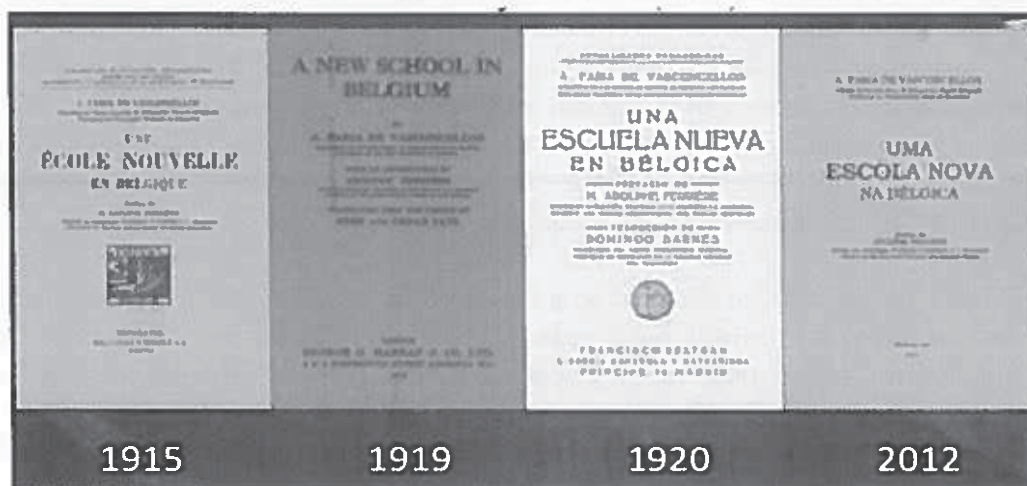
Figure 1. Some publications of Une École Nouvelle en Belgique

sels where he will do his doctorate and, in 1903, edited a small book of psychological and social content, entitled La Psychologie des Foules Infantiles the fruit of a university study. A year later he completed his doctorate in Social Sciences, with the thesis Esquisse d'une Theorie de la sensibilité sociale , which was awarded the rare classification of 'La plus grande distinction'. He exerts teaching positions as Professor of Psychology and Pedagogy at that University, in addition to teaching 'Dramatic Literature' at the University Extension of Belgium.