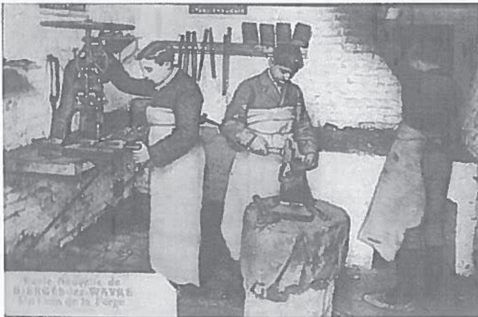
Figure 3. Working the iron in the forge – School of Bièrges, 1913. Source: Vasconcelos (2012).