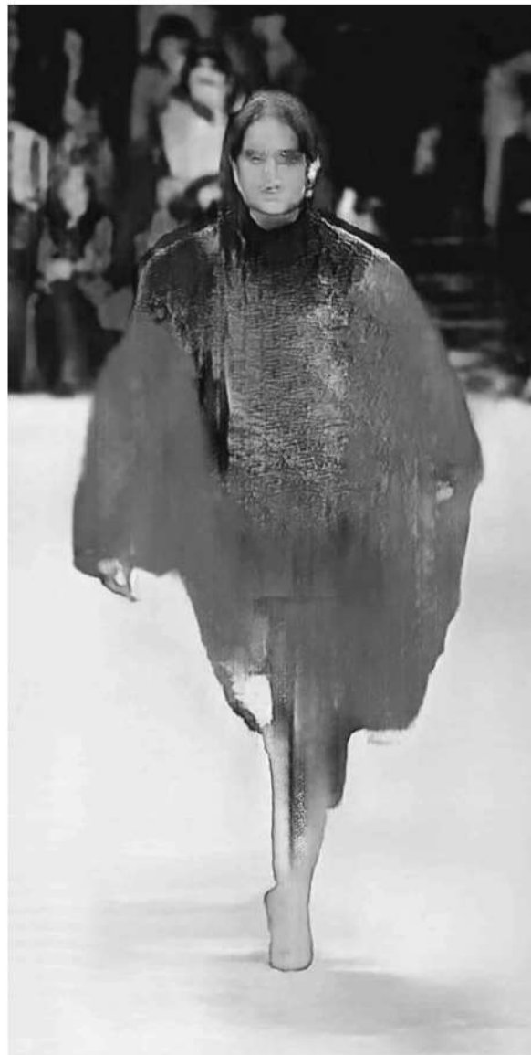
Fig. 1 Robbie Barrat, A look from a hypothetical Balenciaga collection created with AI, 2018.