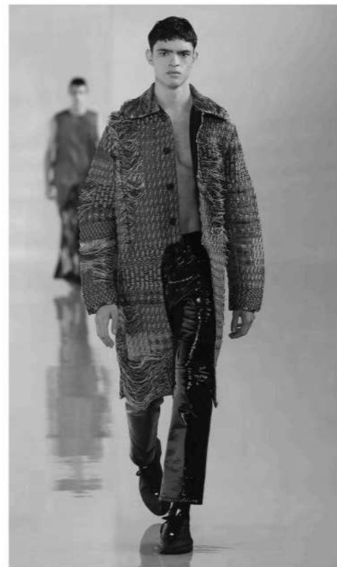
Figs. 2 & 3

(Left) Acne Studio, Fall/Winter 2020 men's collection, collaboration with Robbie Barrat and AI, 2020. The physical garment reproduces the glitches and the errors of the digital garment obtained with AI. (Right) Acne Studio, Fall/Winter 2020 men's collection, collaboration with Robbie Barrat and AI, 2020. The physical garment reproduces the glitches and the errors of the digital garment obtained with AI.