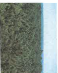
(1) Maritime pine forest