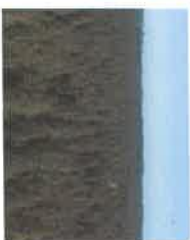
(2) Eucalyptus plantation

For the application of this new version we only need to establish a linear regression of throughfall ( T_f ) vs. gross rainfall ( P_g ) using data from all storms large enough to saturate the canopy.