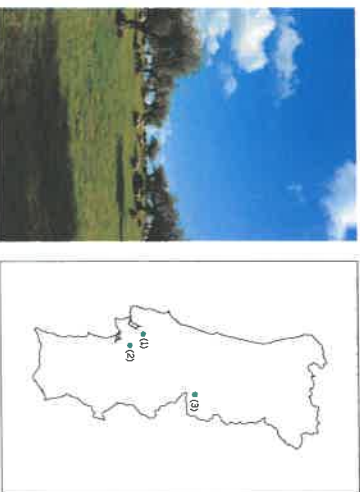
(3) Traditional olive grove